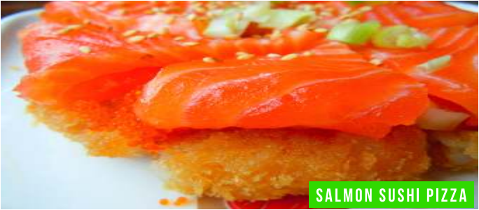
SALMON SUSHI PIZZA