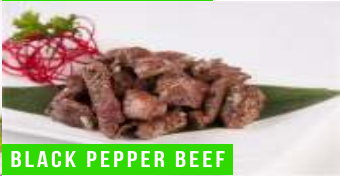
BLACK PEPPER BEEF