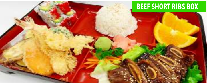
BEEF SHORT RIBS BOX