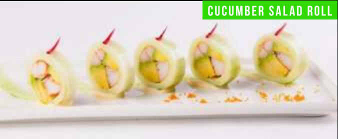
CUCUMBER SALAD ROLL